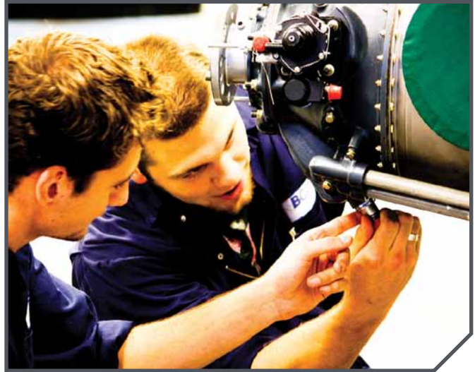
Students learn maintenance procedures on PT6

As a direct result of incorporating 3D equipment simulations in its courses, BCIT is helping its students to acquire a higher level of knowledge and skill. Confident in how BCIT students are learning with simulations, this cutting-edge school is now making this new teaching platform available online to colleges across Canada so that they may also use the simulated PT6A engine as a training module.