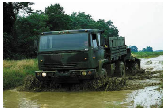
The FMTV is powered by the 3126 Caterpillar engine

Additionally, instructors identified that it is difficult to show and train on many functional characteristics such as firing order, fluid flow, air flow and other procedures with live engines. Given these limitations, the Army turned to technology-based solutions to achieve their training objectives at a lower cost.